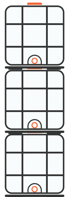
Not more than 3x1000L IBC totes.