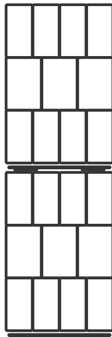
Stack no more than 2 pallets.